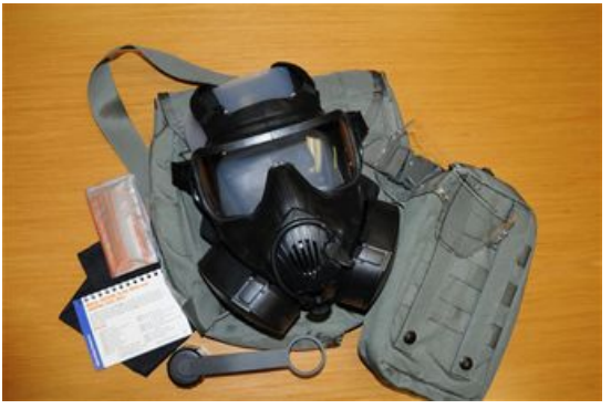
Figure 1. Components of the M-50 FPM

b. <u>Components of the M-50 FPM</u>. When you receive your FPM, you should inspect the following components for serviceability (See fig. 1):